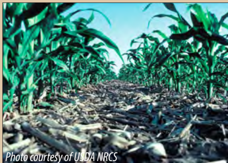
Done correctly, no-till corn cropping systems require less of a producer's time at spring planting.

Keep in mind that an improved quality of life is another reward. In addition to producing comparable yields to conventional corn when done correctly, no-till corn cropping systems also require less of a producer's time at spring planting. Often, saved time is more important than improved yields in motivating farmers to make the switch. We have heard farmers say that before no-till they never had time to go to their kid's baseball games, because their tillage systems required more equipment passes in the field than no-till. This quality-of-life issue is important to many farmers.